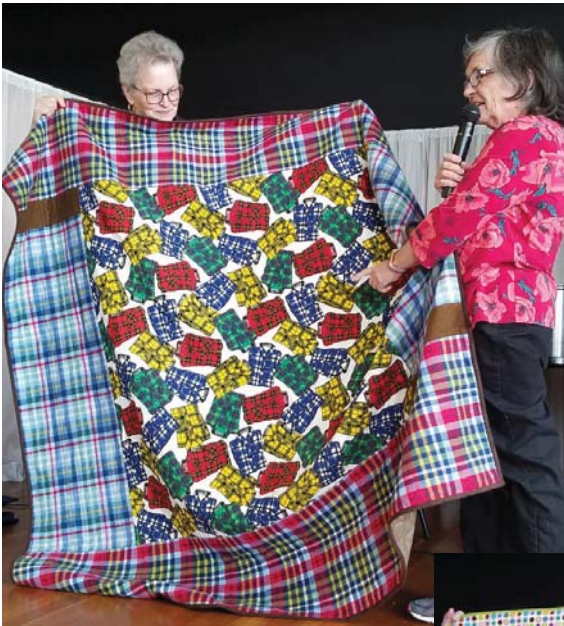
Warm, cozy and heavy, flannel!