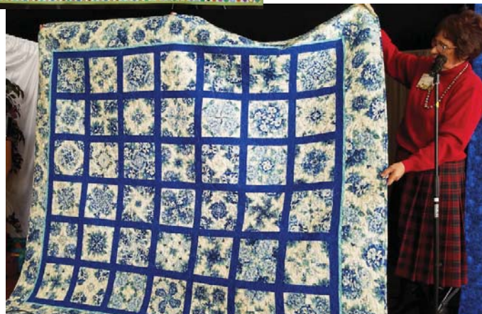
A simple pattern, but very beautiful quilt.