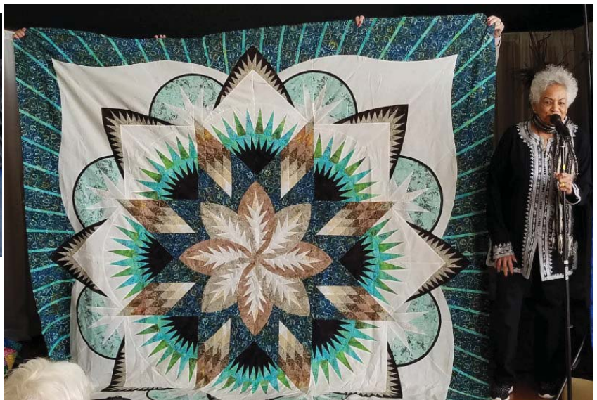
This whole quilt was paper pieced!