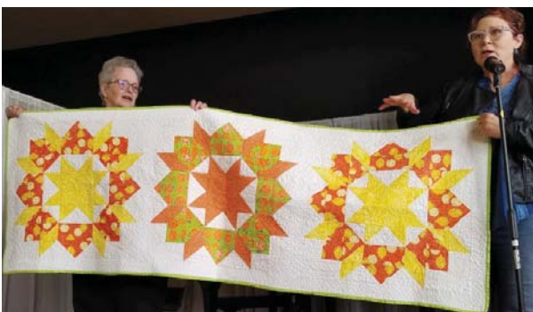
First time doing her own quilting!!! Wow!