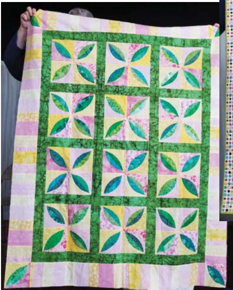
Great job, new quilter!!!