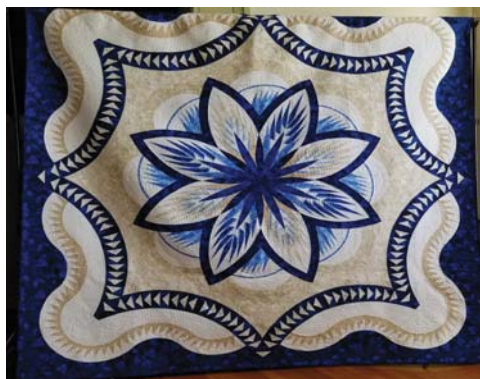
Rhapsody in Blue

to the public at the Visalia Spring Fest Home Show; Feb. 7, 8, and 10. Volunteer slot sign-ups are available at the back table. Carmen will be calling to fill in the open spots.